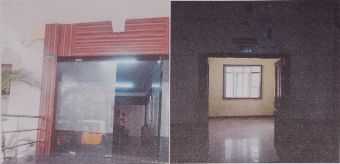
CCTV cameras arranged at College main gate and Principal's chamber.