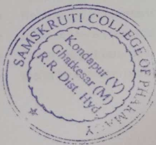
Principal Samskruti College of Pharmacy Kondapur (V), Ghatkesar (M), Medchal Dist. PIN-501301