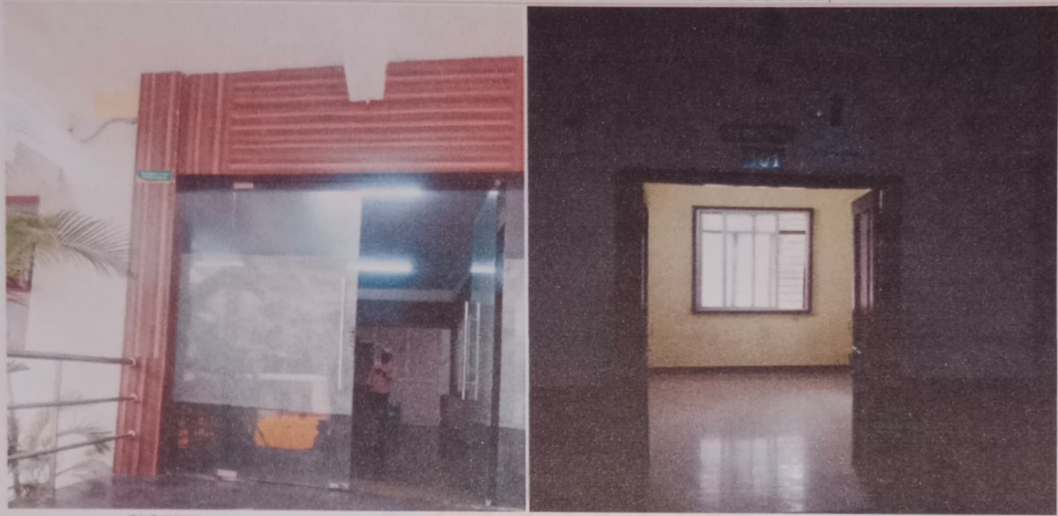
CCTV cameras arranged at College main gate and Principal's chamber.