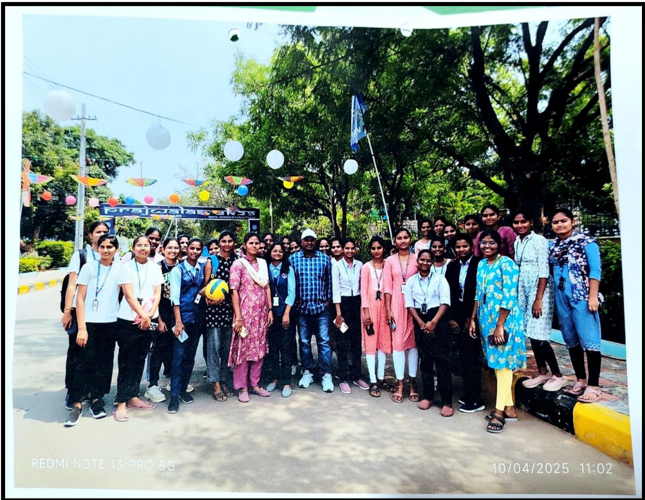
VIGNAN COLLEGE SPORTS MEET WITH PARTICIPANTS AND PHYSICAL DIRECTOR