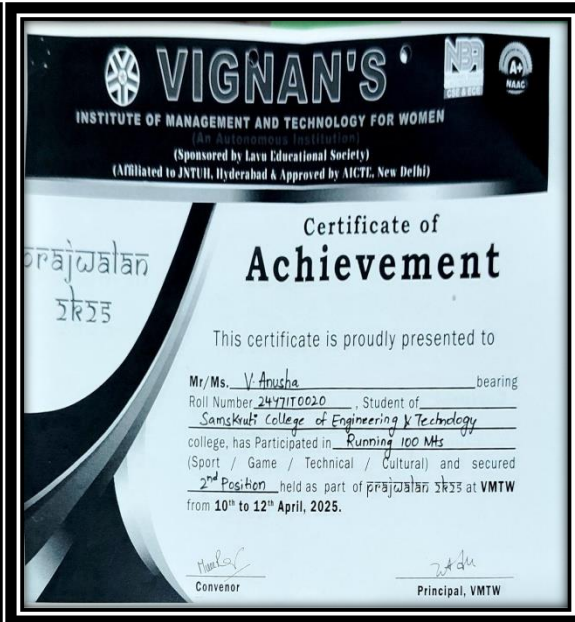
1 st AND 2 nd PRIZE CERTIFICATES OF PARTICIPANTS IN RUNNING COMPETITION (100 METERS)