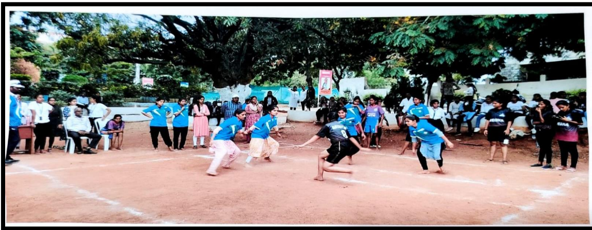
WOMENS KABADDI SPORTS MEET

The participation of our college in “Prajwalan 2k25” Inter-Collegiate Sports Fest was highly successful and rewarding. With 42 girls participating across multiple events and securing top positions in running races, our students have showcased their athletic talent and competitive spirit. This event provided an excellent platform for exposure, teamwork, and personal development. The college looks forward to continued encouragement of sports activities and greater participation in future competitions.