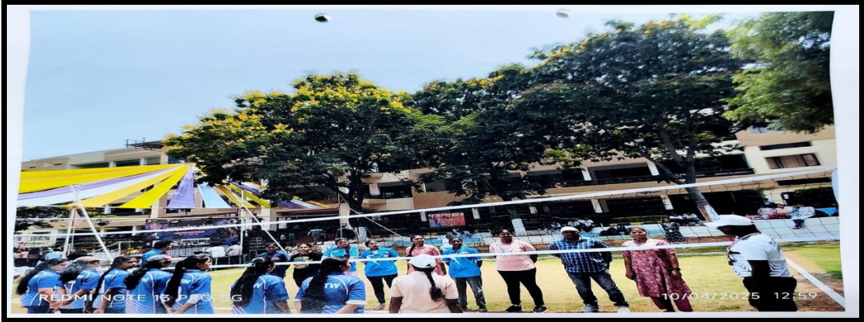
VOLLEY BALL WOMENS SPORTS MEET