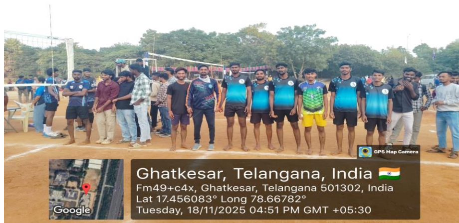
VOLLEY BALL AND KABADDI TORUNAMNETS

SMSK College looks forward to continuing active participation in similar inter-collegiate sports festivals in the future.